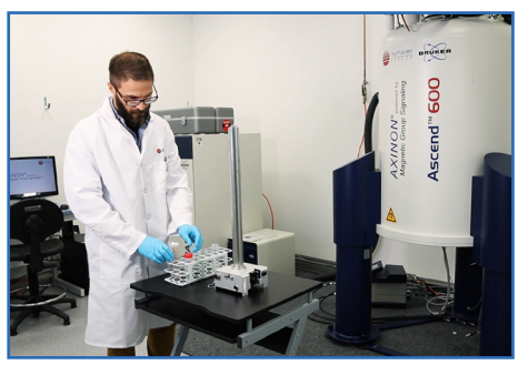
Place the probe upright onto a stable surface. Avoid tipping it over.