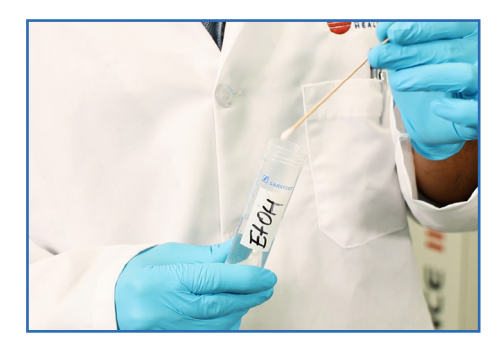
Soak the tip of a cotton swab with 96% ethanol from a clean tube. Use lint-free swabs to ensure probe is not contaminated.