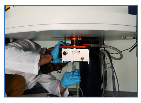
Loosen the screws at the bottom of the probe while holding the probe.

! Hold the probe tight to prevent fall and damage!