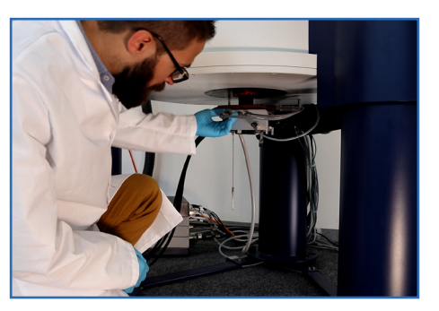
Carefully disconnect all cables and the BCU connection from the probe.