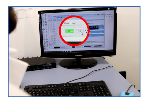
Turn off the temperature control unit (vtu) in TopSpin.

*Only for trained personnel. Also refer to Bruker manual: Bruker NMR magnet system.