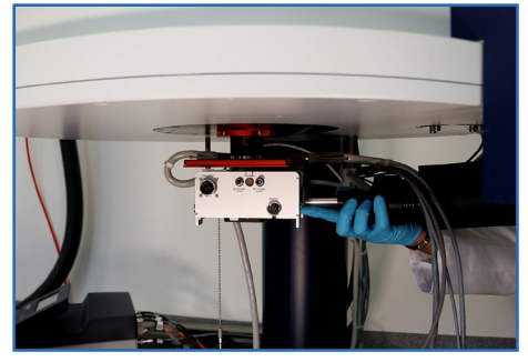
Reinsert the probe and fasten screws. Reconnect all cables and reattach the BCU connection.